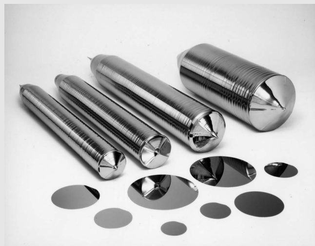
FIGURE 4.7 Silicon crystals (ingots), and wafers sliced from an ingot and polished.